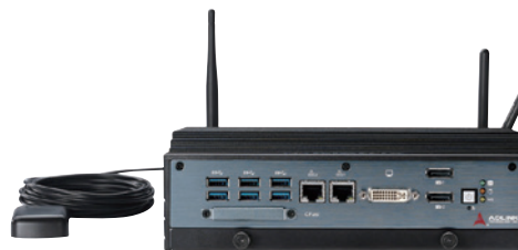
MXE-5400 with Antenna