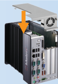
3. Replace it by plugging the hot-pluggable fan module cover into the fan connector on CPU board