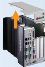
2. Withdraw the thumbscrew and remove the top cover