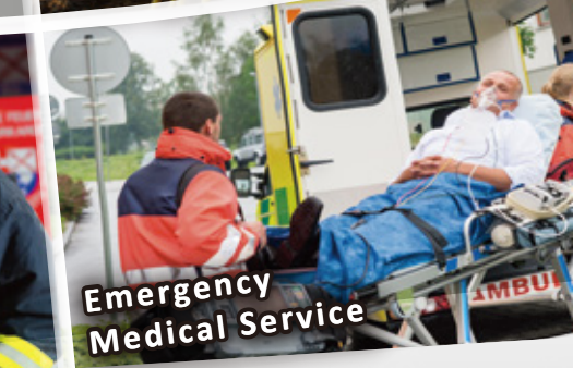
Emergency Medical Service